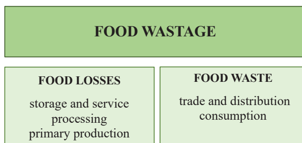
Figure 1. Classification of concepts related to food wastage

According to Małgorzata Wiśniewska and Joanna Wyrwa [2022], food losses occur in various stages, including agricultural production, storage, transportation, and